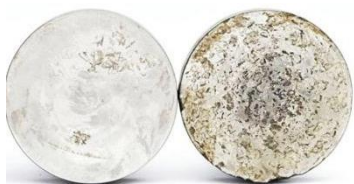
F1 FD SAE 5W20 Pass